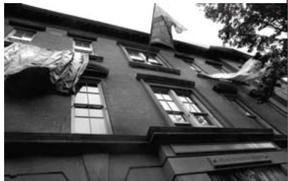
Unfurling of new rainbow flags

In opposition to the flag-burner's intentions, we have emerged brighter and braver than ever. The Center, along with the help of social justice leaders, NY City Council Speaker Christine Quinn, Center employees & volunteers participated in a community rally drawing more than 200 people. Crowds flooded to West 13th Street as we unfurled brand new rainbow flags. The Center stands as a beacon of hope for our entire community.