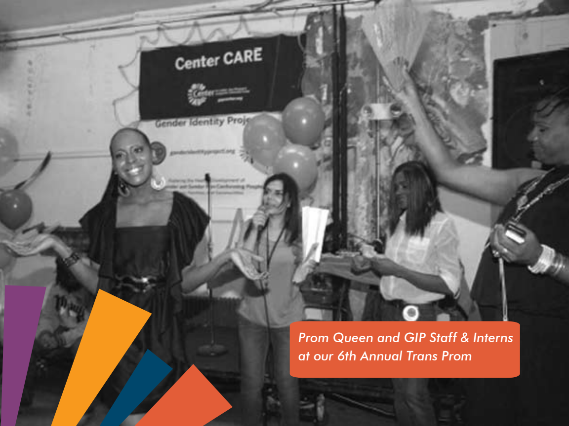
Prom Queen and GIP Staff & Interns at our 6th Annual Trans Prom