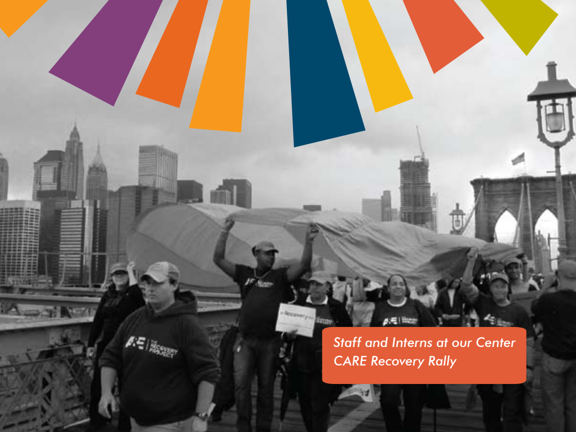
Staff and Interns at our Center CARE Recovery Rally